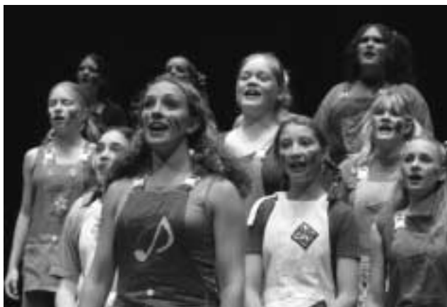
Music for Youth participants at the National Festival 2002 (Andy Howes)