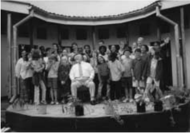
International School Moshi, Baobab College, Lusaka, Zambia